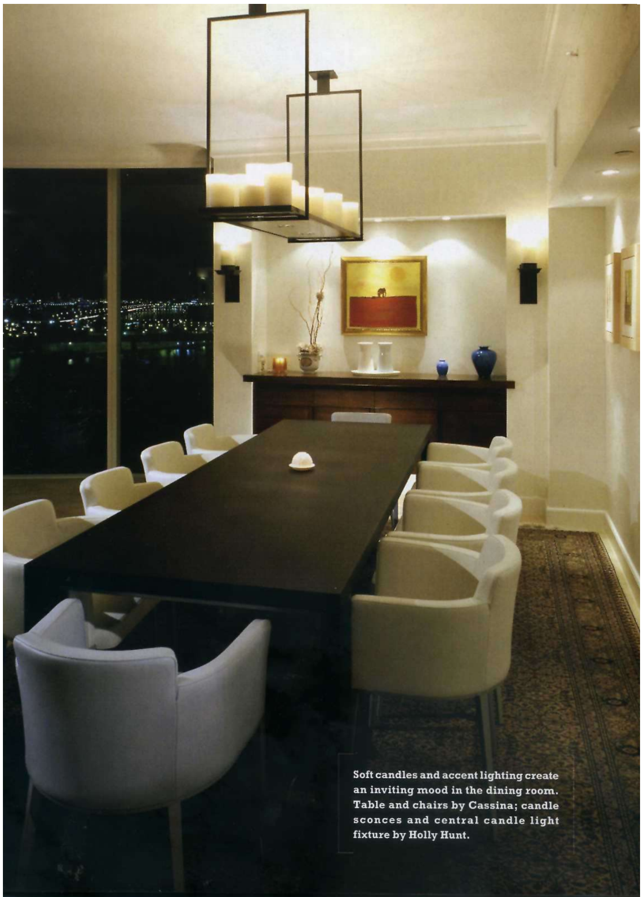
Soft candles and accent lighting create an inviting mood in the dining room. Table and chairs by Cassina; candle sconces and central candle light fixture by Holly Hunt.