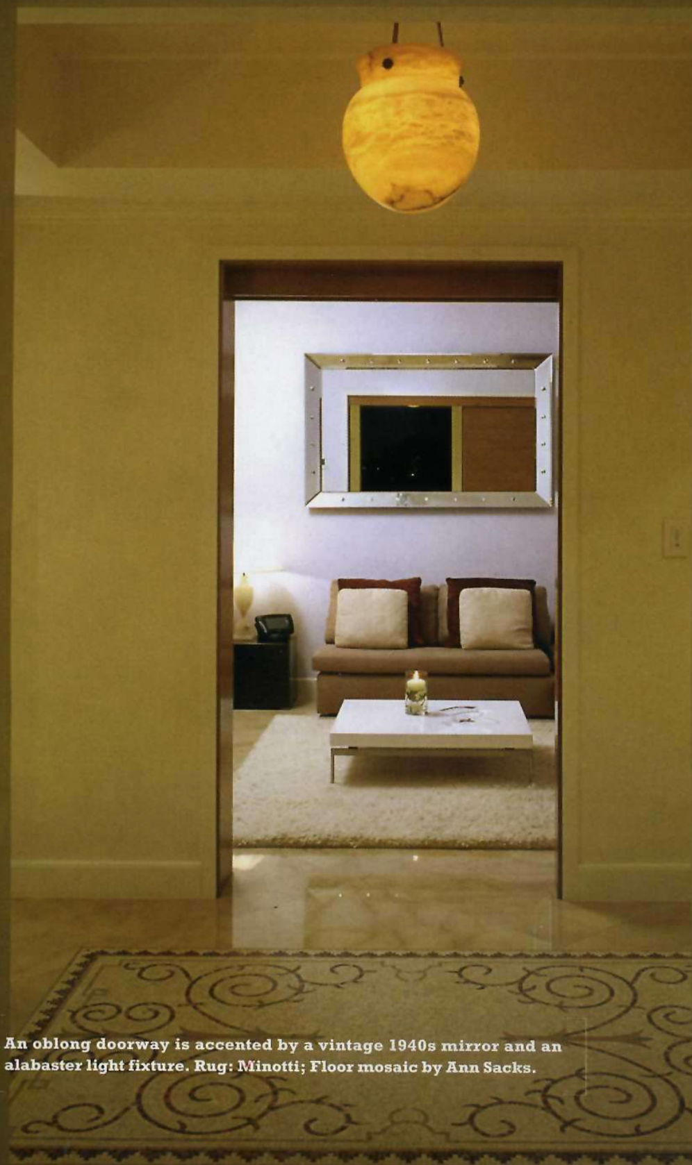
An oblong doorway is accented by a vintage 1940s mirror and an alabaster light fixture. Rug: Minotti; Floor mosaic by Ann Sacks.