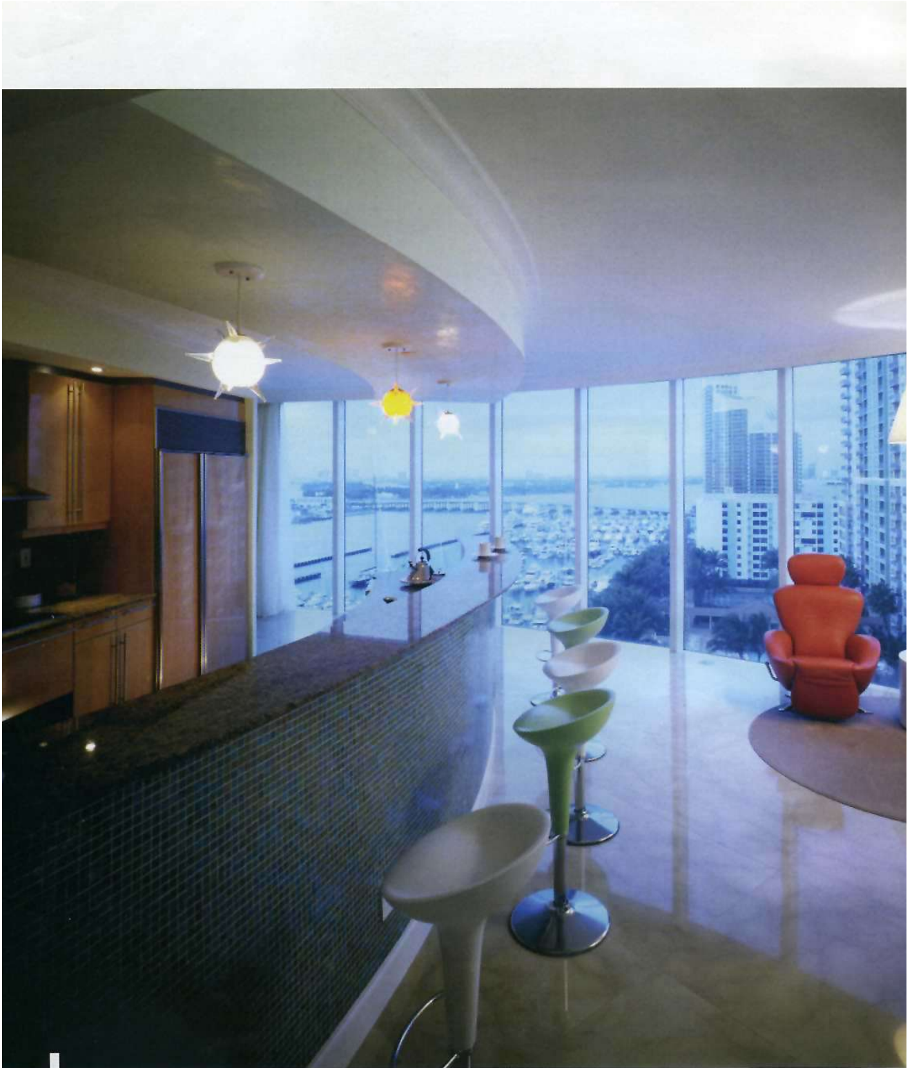
A dusk backdrop adds to the unique design, playful furniture and grand French marble floor. Bar stools: Bombo by Magis, Italy; light fixtures: Lunatica; mosaic tiles: Bizazza.