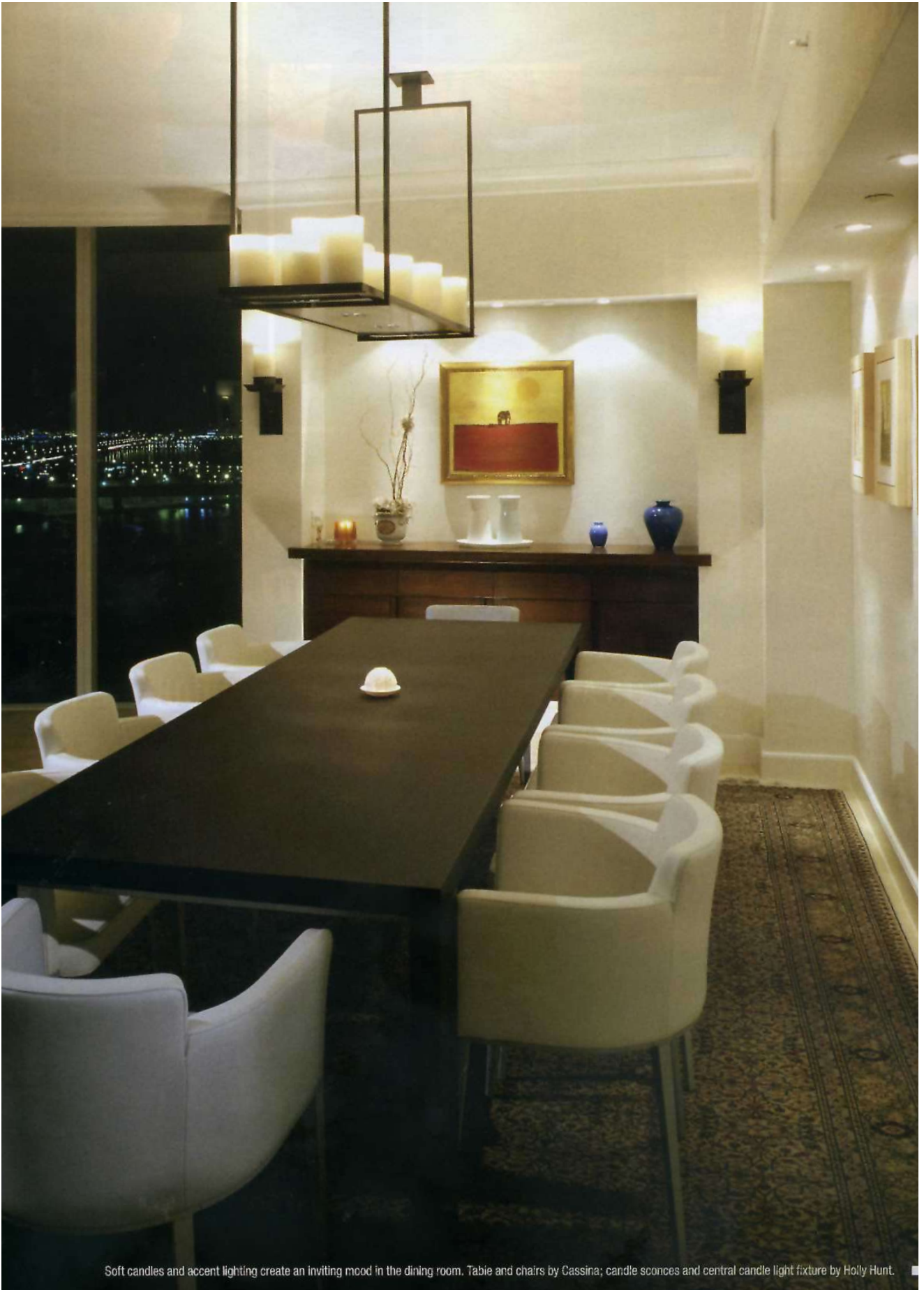
Soft candles and accent lighting create an inviting mood in the dining room. Table and chairs by Cassina; candle sconces and central candle light fixture by Holly Hunt.