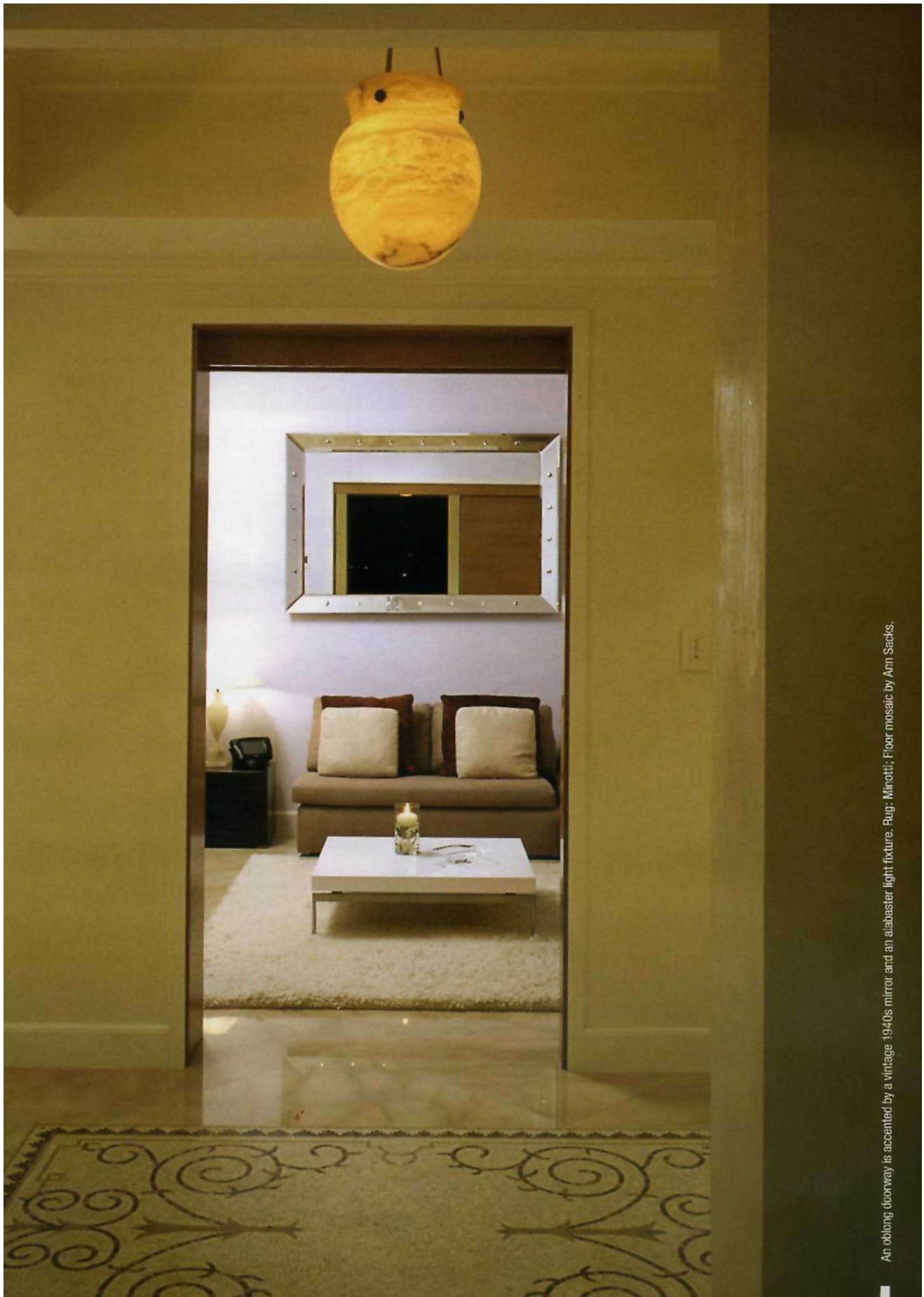
An oblong doorway is accented by a vintage 1940s mirror and an alabaster light fixture. Rug: Minotti; Floor mosaic by Ann Sacks.